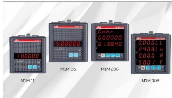
ABB offers a Comprehensive portfolio of meters. Complete range of Voltmeters, Ammeters & Network Analyzers